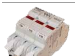
WMB Marker System